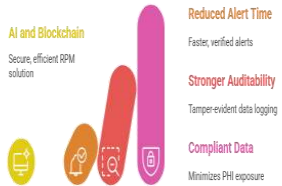
Figure-2. AI and Blockchain Enhance RPM

Policy and technical ecosystems are aligning to address these gaps. Global bodies emphasize safe, effective telemedicine at scale; regulators have clarified expectations for non-invasive RPM devices post-pandemic; and the FHIR standard is now widely adopted to structure and exchange clinical data. These programs underscore the need for systems that are interoperable by design, resilient to cyberthreats, and respectful of patient rights and consent across jurisdictions.